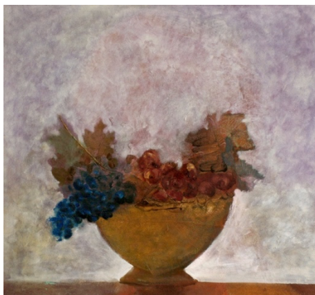
Fruit Bowl after Caravaggio, Oil on board, 65 x 60 cm