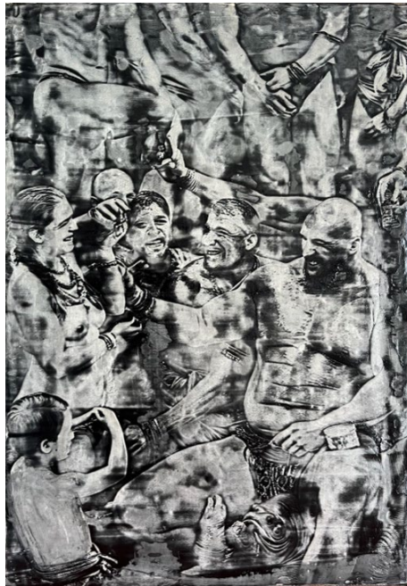
Figures , Oil on canvas, 43.3 x 30.1 cm

For example, in the painting Figures (2024), Burford forges a hybrid post-digital work that transforms the output encoding from Latent Space into a unique physical handcrafted oil painting on canvas.